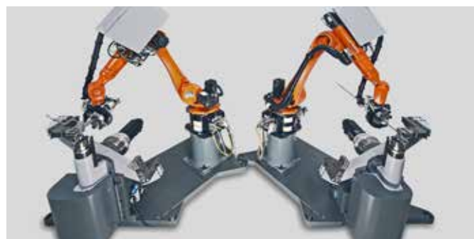
▼ TWISTER 2 TWINS