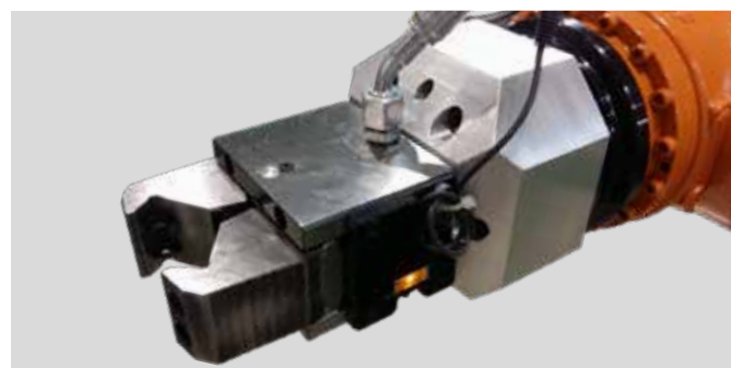
▲ Power Gripper