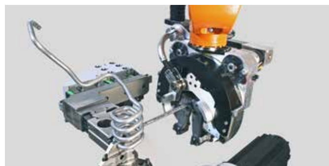
▲ Rotary gripper with bending head

High production output and a long service life will save money and shorten the amortization time of your investment.