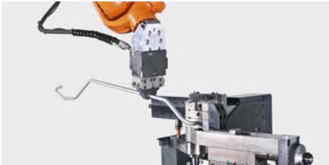
▼ TWISTER 2 20-R