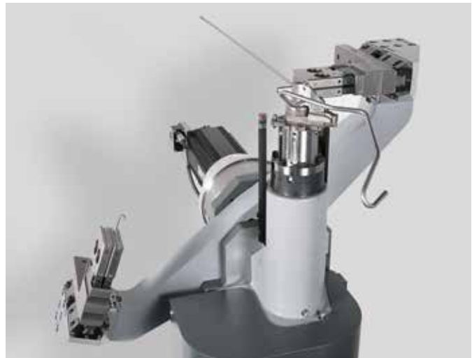
▼ Bending head TWISTER 2 12-RL