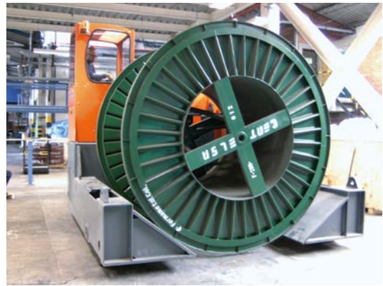
HUBTEX model KT 200 deployed at a customer's premises in Colombia

They can transport any type of drum or coils (for example reels for cable or flexible pipe) with a diameter of up to 5.0 m and a width of up to 3.5 m.